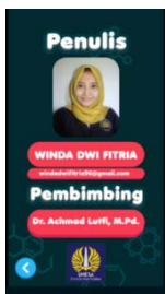
Fig. 2b Display after