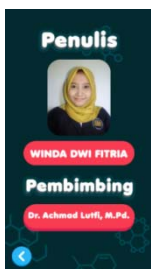
Fig. 2a Display before

At this stage, the game will be improved related to suggestions and input at the review stage that is not in accordance with the expected criteria. Here is one example of improvement after the review process, namely the absence of the university logo on the author's menu in Figure 2a, then the repairs are carried out as shown in Figure 2b.